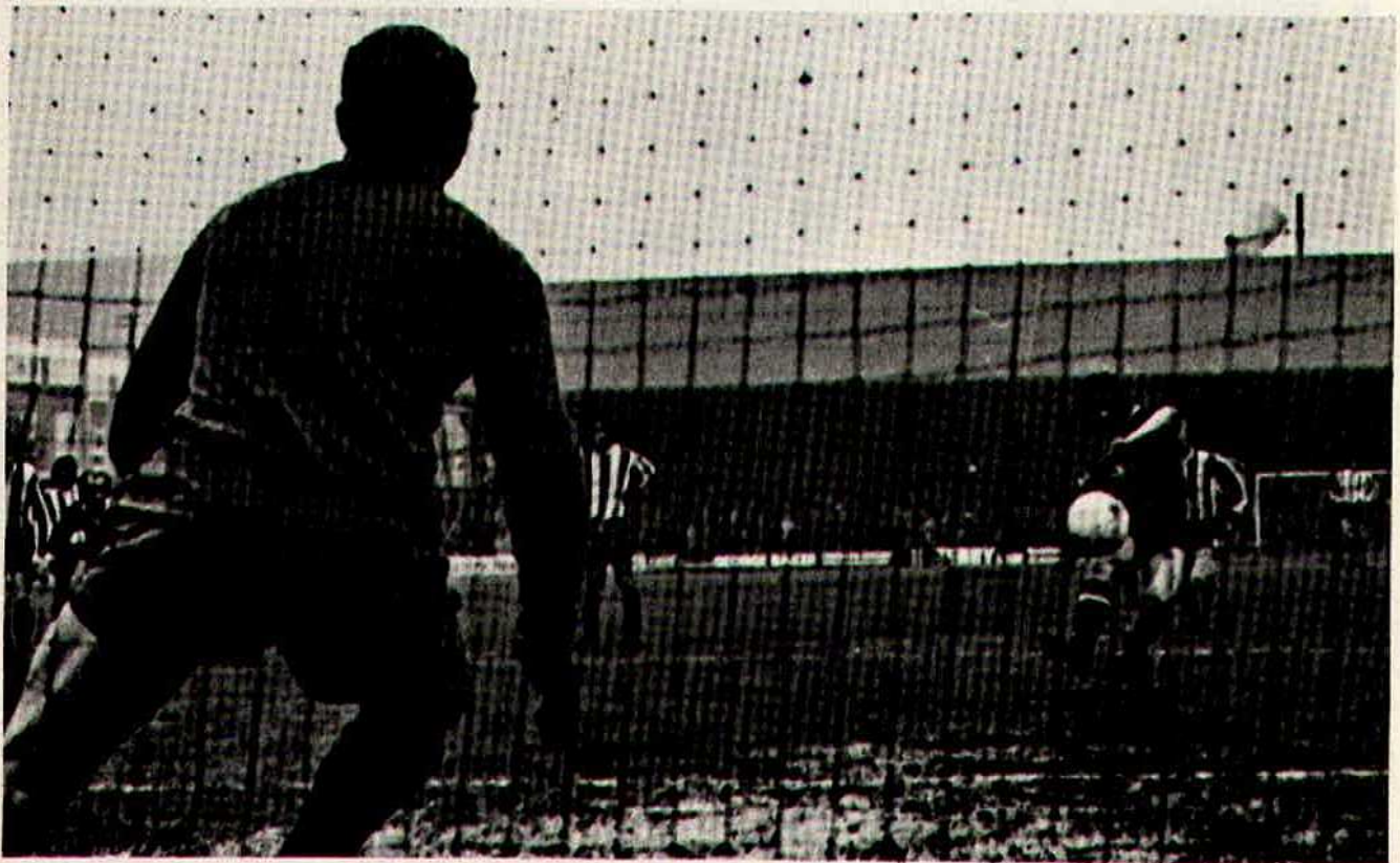
Ray Treacy scores Swindon's only goal of the game at Brighton from the penalty spot.